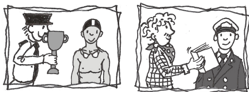
Figure 2: Examples of experimental stimuli depicting ditransitive events.

To balance for order effects and verb effects, in both conditions, there were 4 confederate variants with structures alternating per verb. The sentences we used were Dutch translations of the sentences employed by Branigan et al. (2000) in their picture-matching task. An experimental pilot ( N=33 ) revealed a possible effect of the monotransitive fillers on the experimental trials; in Dutch, unlike in English, ditransitive verbs such as geven ‘to give’ or overhandigen ‘to hand over’ can be used in monotransitive constructions as well. Therefore, we adapted the fillers in such a way that they resembled the experimental trials in terms of length and syntactic complexity by including a propositional phrase (e.g., ‘The boy is drawing a picture on the board’, instead of the original ‘The boy is drawing a picture’).